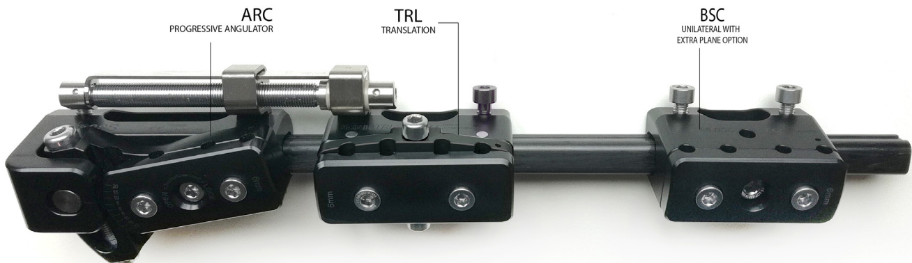
Example setup: The ARC, CD unit, TRL and a BSC