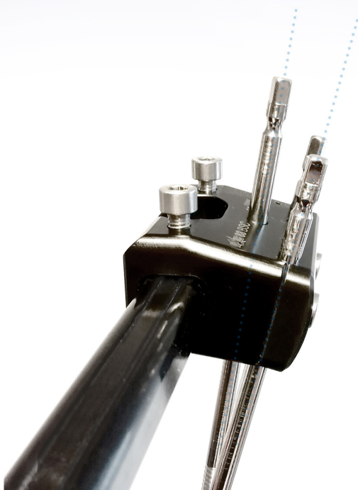
Modular with FIXUS88 Bi-planar Vpin option