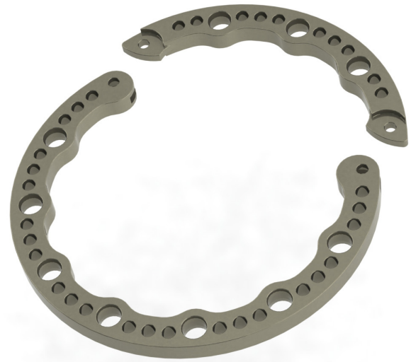
2/3 and 1/3 rings for individual or combined use

The FIXUS66 Hybrid rings are available in 1/3 and 2/3 rings, which can be combined to one full ring. The way unique connection of the 1/3 and 2/3 ring connect make for a solid full ring for maximum stability.